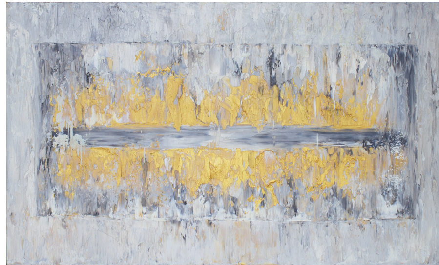
Ice Cube Rectangle , 2013, Oil on canvas, 36 x 60 in.