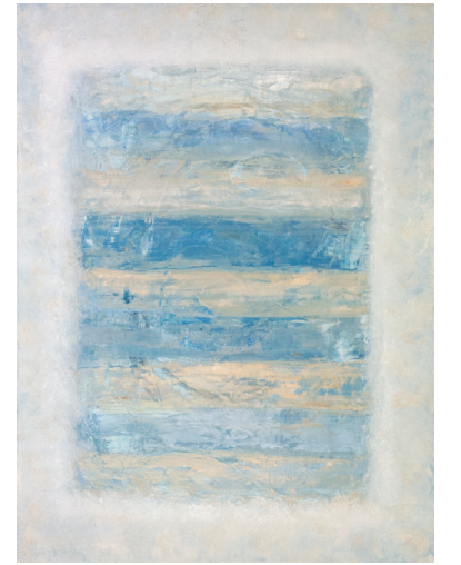
Blue Shutters 2 , 2014, Oil on canvas, 48 x 36 in.