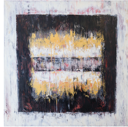
Ice Cube Black & Red , 2016, Oil on canvas, 60 x 60 in.