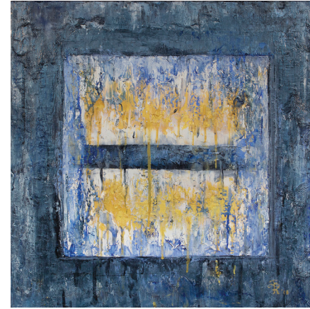
Ice Cube Gothic , 2018, Oil on canvas, 30 x 30 in. Private collection.