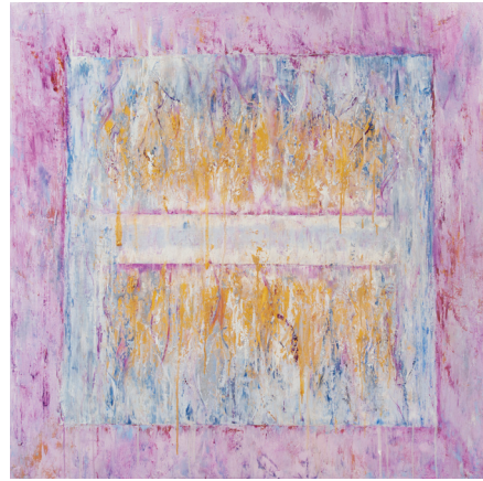
Ice Cube Lilac , 2018, Oil on canvas, 60 x 60 in.