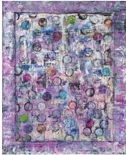
Bubbles , 2016, Oil on canvas, 60 x 48 in.