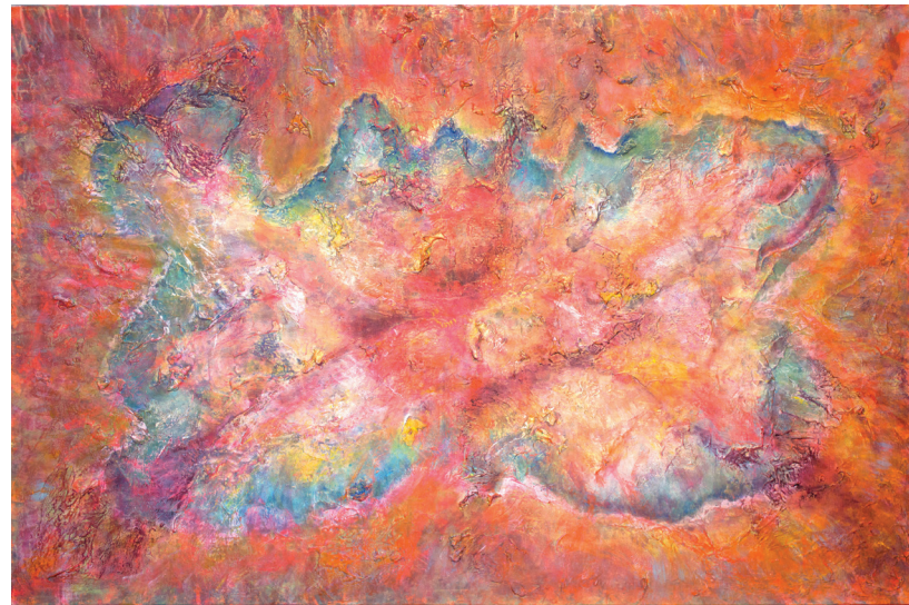
Orchid , 2018, Acrylic on canvas, 72 x 48 in. Private collection.