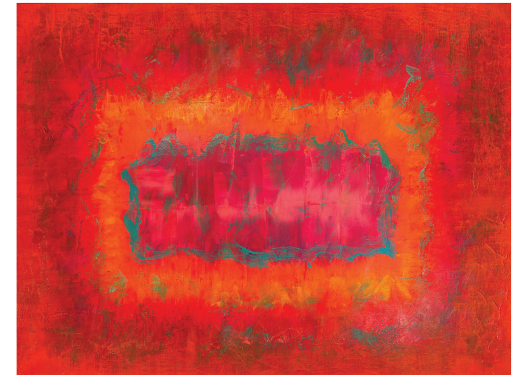
Tie Dye , 2014, Oil on canvas, 36 x 48 in. Private collection.

425 MOUNT PLEASANT AVENUE MAMARONECK, NY 10543