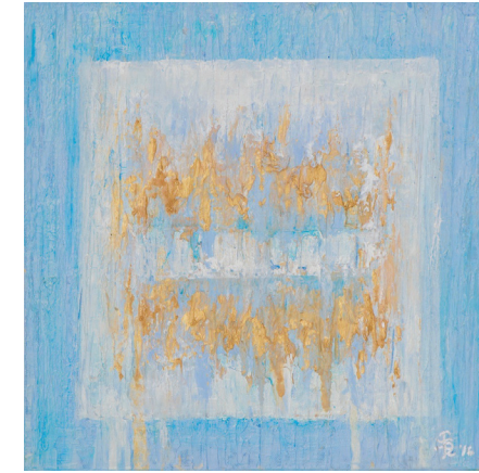
Ice Cube Small 2 , 2016, Oil on canvas, 12 x 12 in.